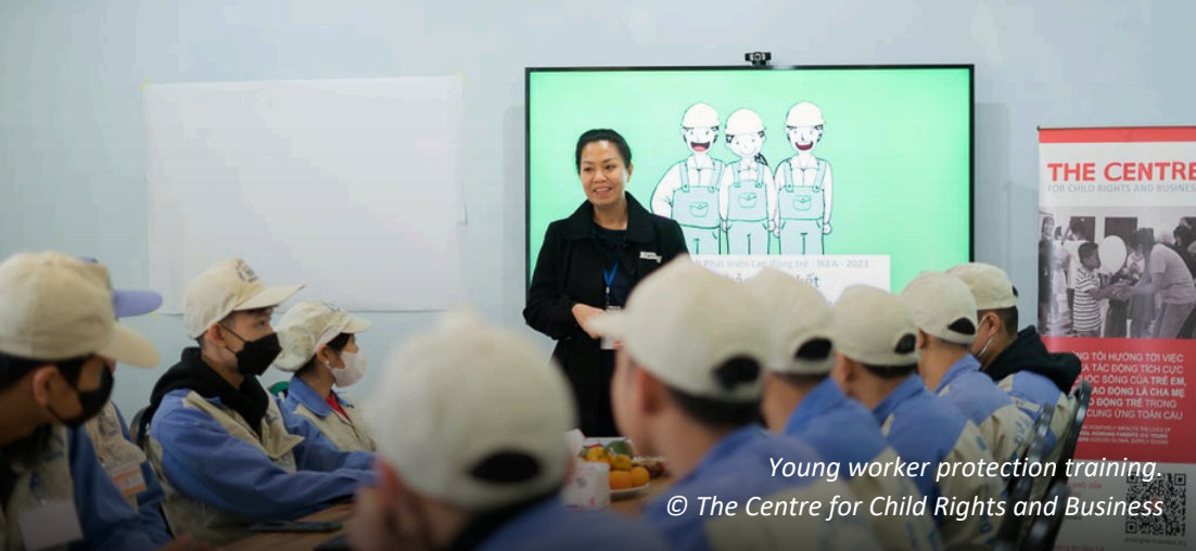
Young worker protection training.