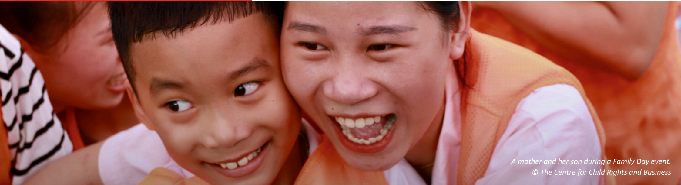
A mother and her son during a Family Day event.