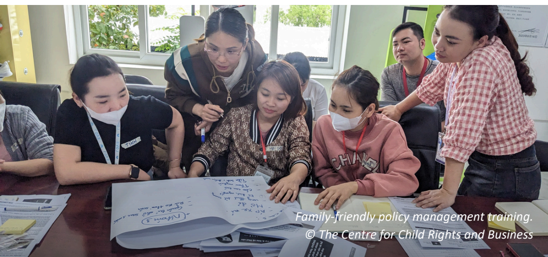
Family-friendly policy management training.