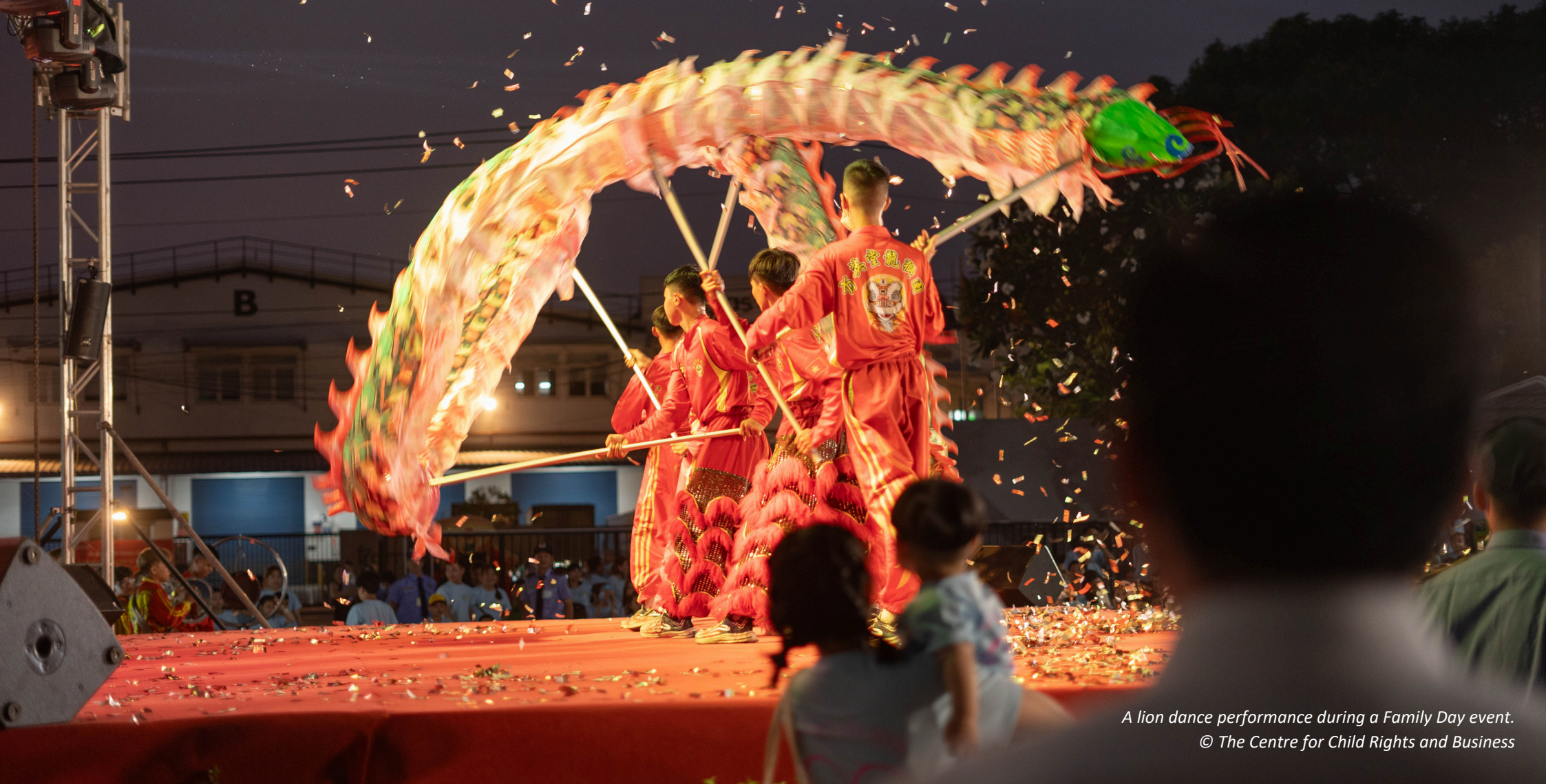
A lion dance performance during a Family Day event.