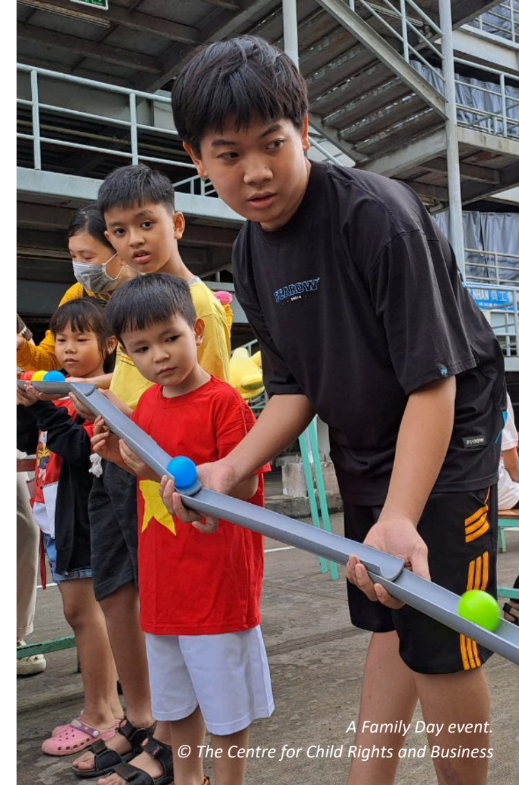
A Family Day event.

Investing in family-friendly workplace programmes brings tangible, direct benefits to workers, their families and employers. Employers can reap the long-term benefits of a more stable, motivated and efficient workforce by creating enabling, supportive environments for parents.