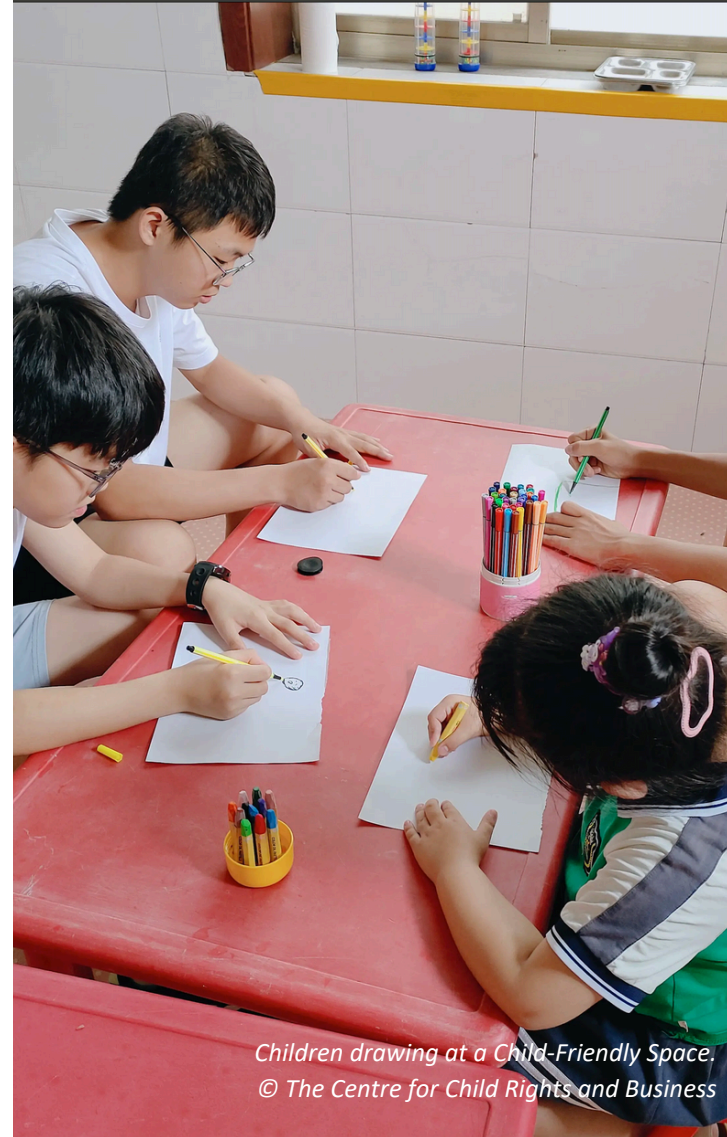
Children drawing at a Child-Friendly Space.