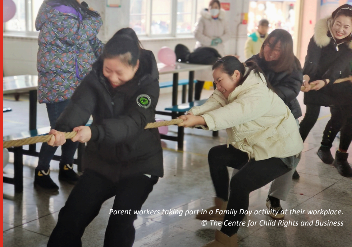
Parent workers taking part in a Family Day activity at their workplace.

Bangladesh, Cambodia, China, Indonesia, Philippines, Sri Lanka, Türkiye, and Vietnam.