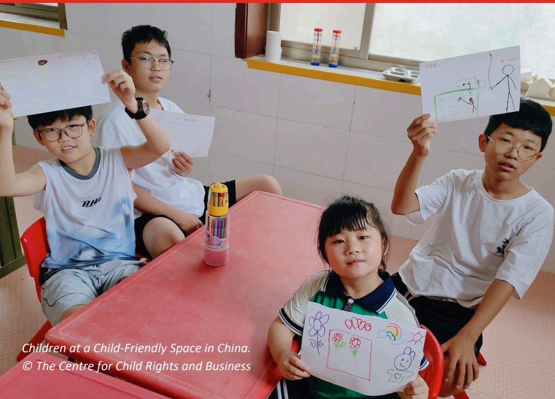
Children at a Child-Friendly Space in China.

To date, we have supported 27 companies in setting up 104 Child-Friendly Spaces globally