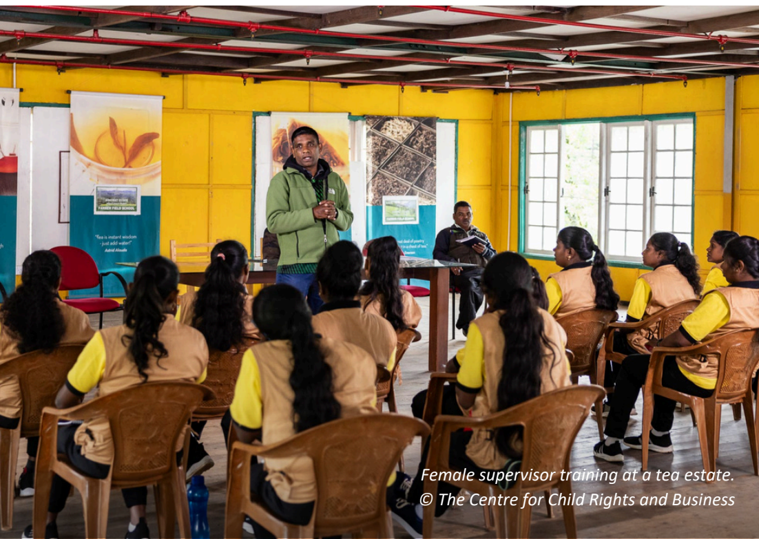
Female supervisor training at a tea estate.