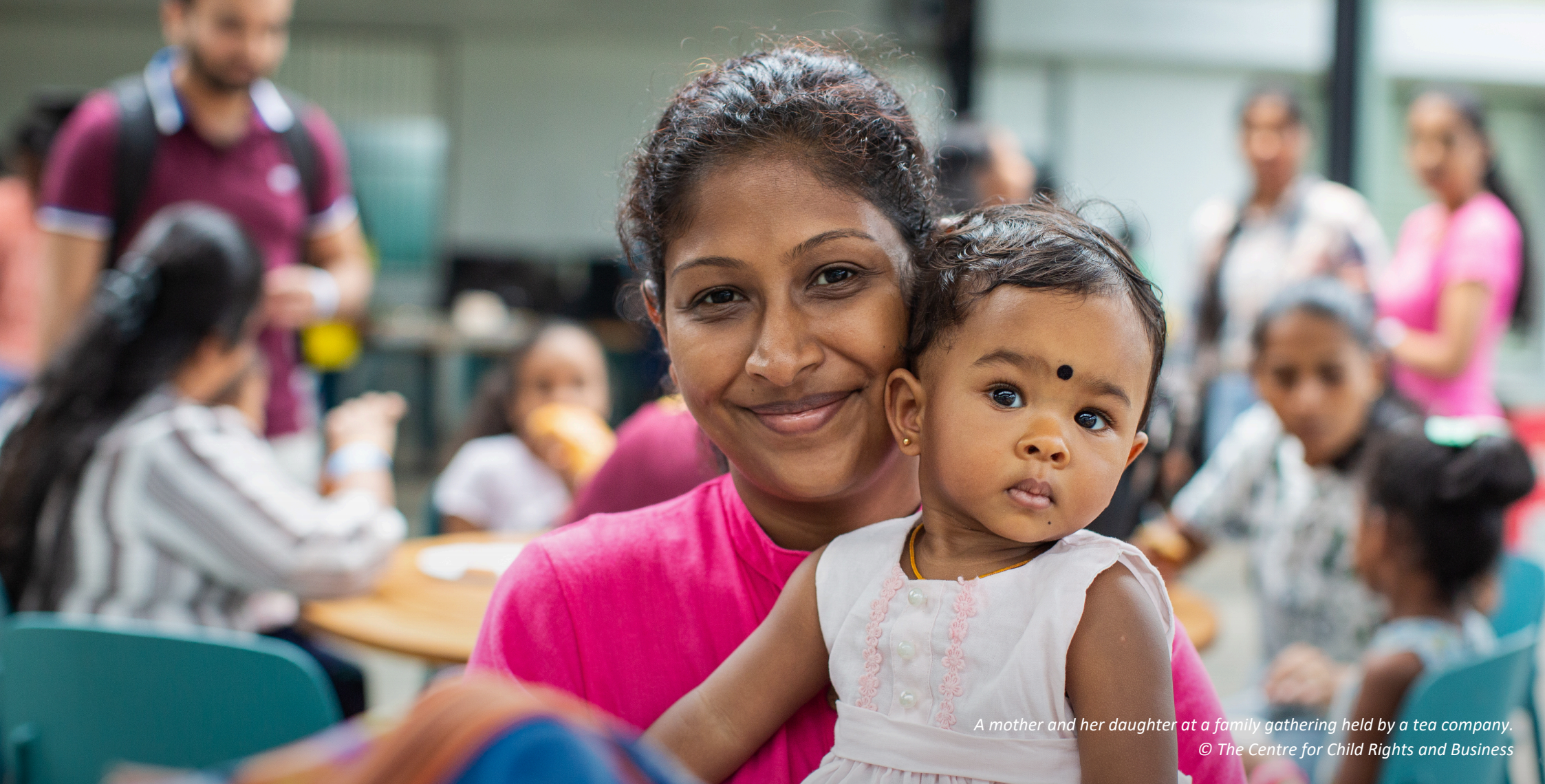
A mother and her daughter at a family gathering held by a tea company.