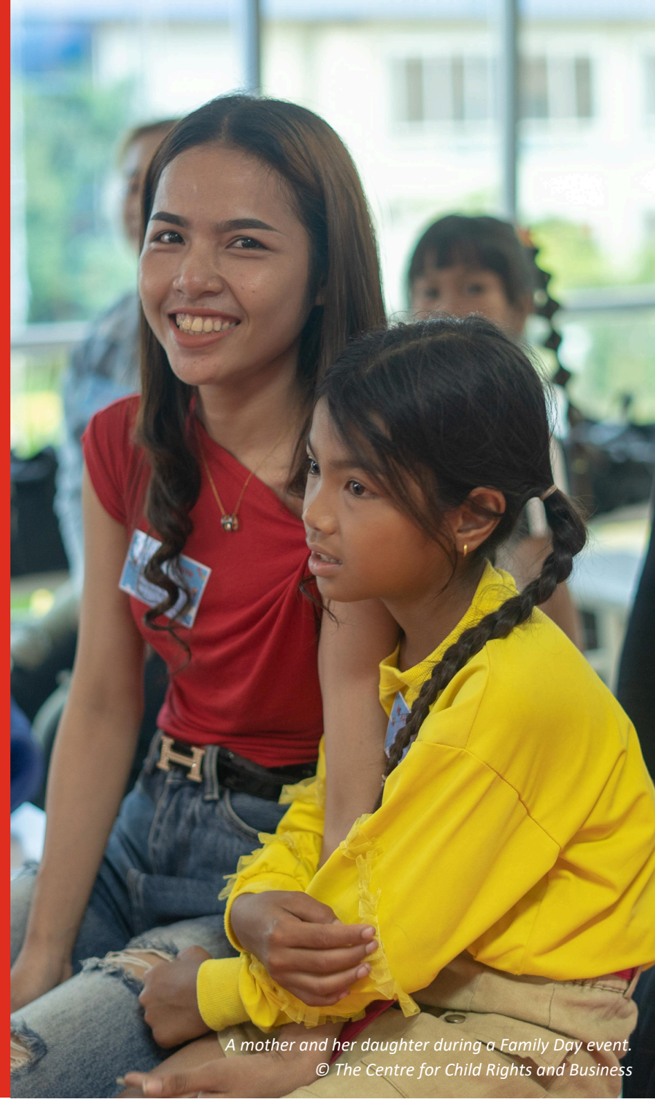
A mother and her daughter during a Family Day event.

Our services cater to the needs of working parents, their children, and young workers, aligning with the business objectives of suppliers. WeCare is dedicated to empowering both workers and factory management teams through knowledge and skills training, building or enhancing supportive workplace facilities, and capacity building and tool sharing.