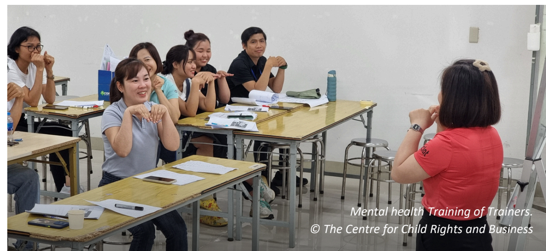
Mental health Training of Trainers.