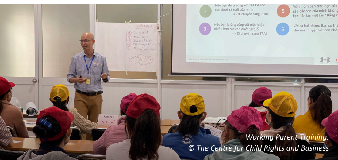
Working Parent Training.