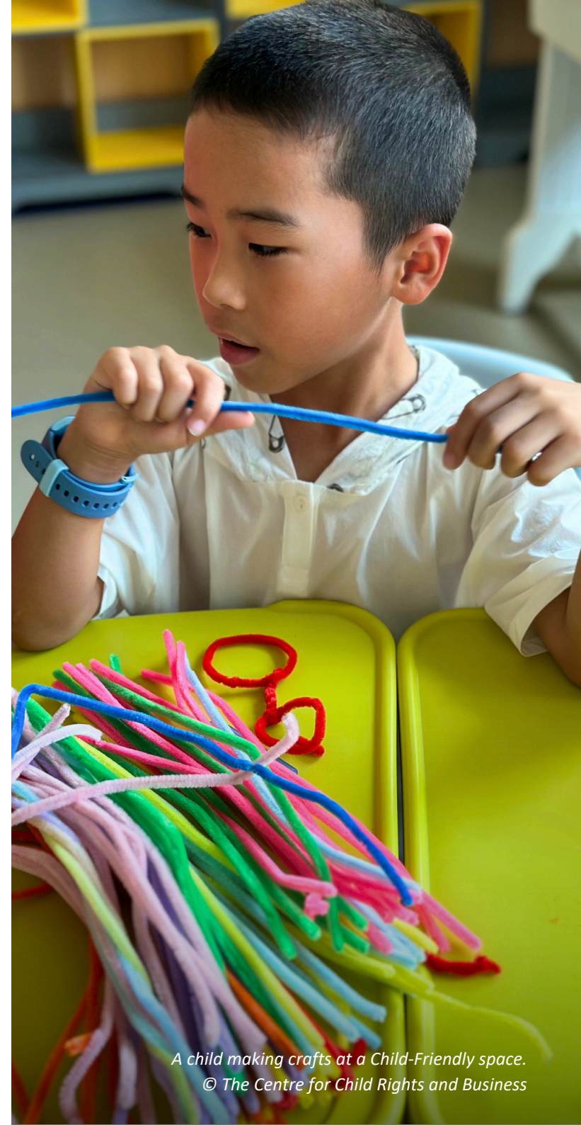
A child making crafts at a Child-Friendly space.

were trained to continue running the Child-Friendly Spaces independently while following The Centre's guidelines