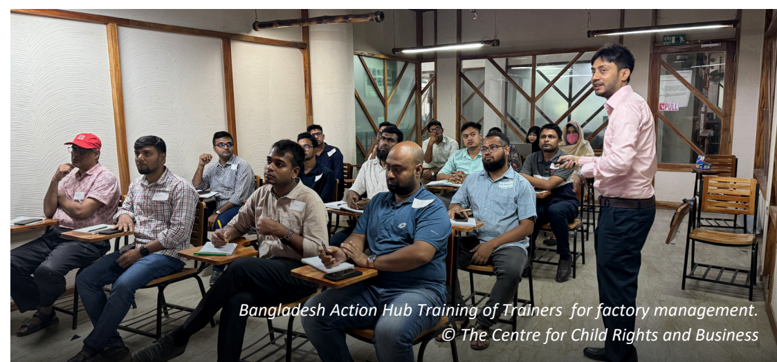
Bangladesh Action Hub Training of Trainers for factory management.