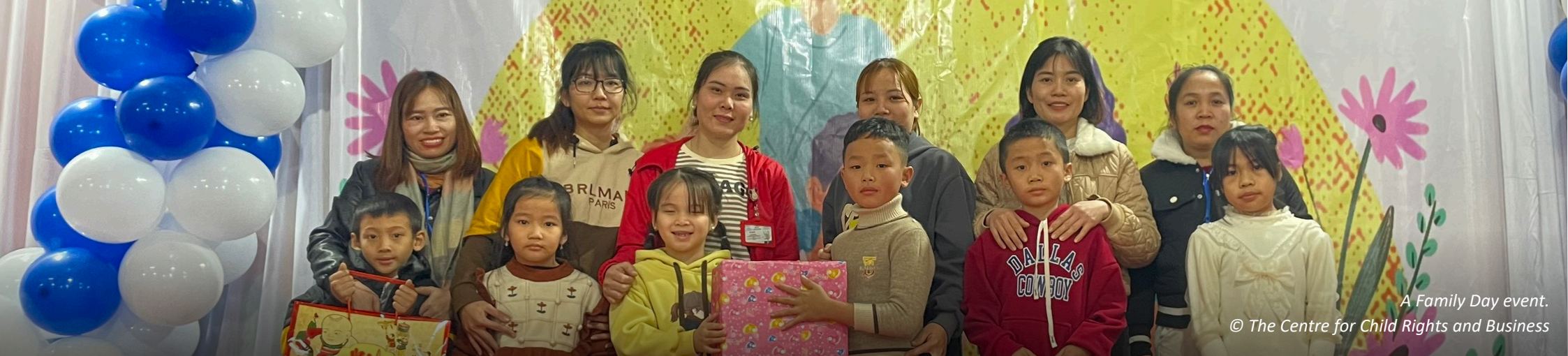
A Family Day event.