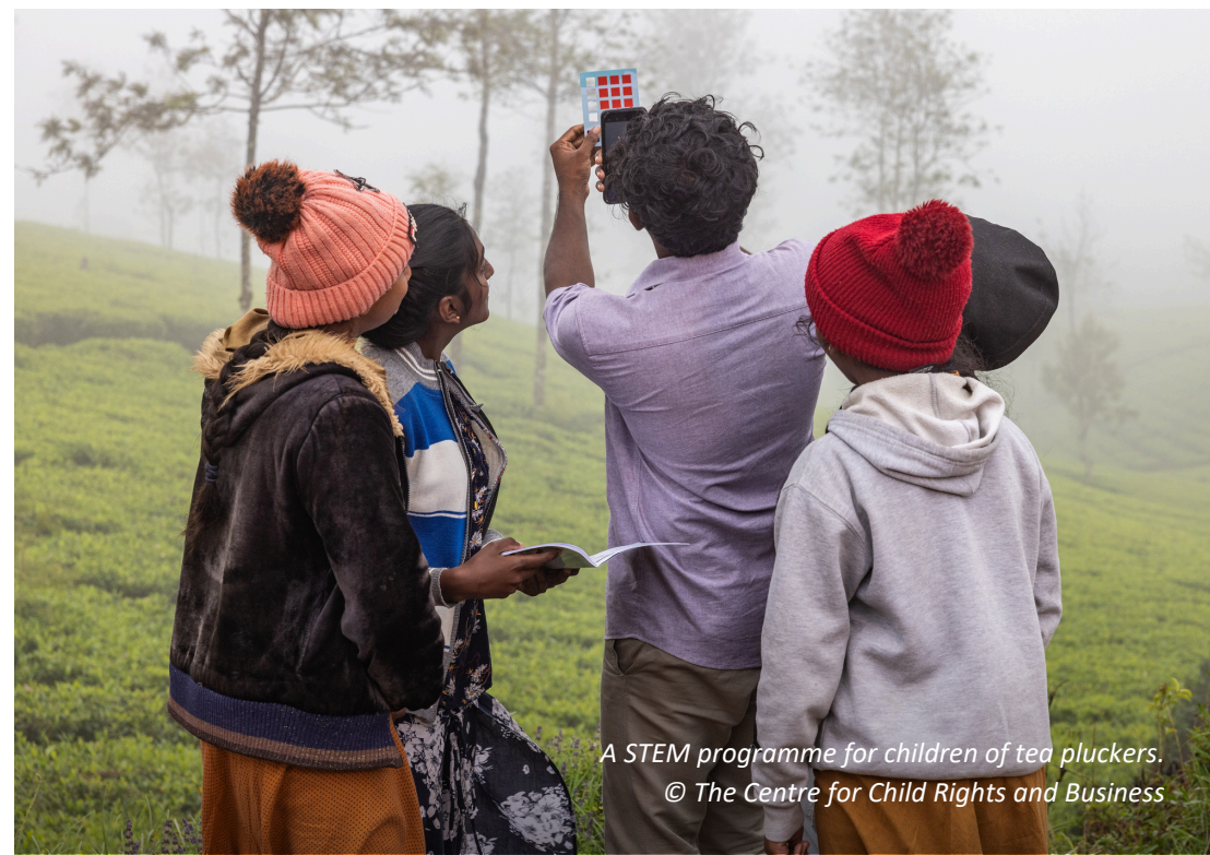
A STEM programme for children of tea pluckers.