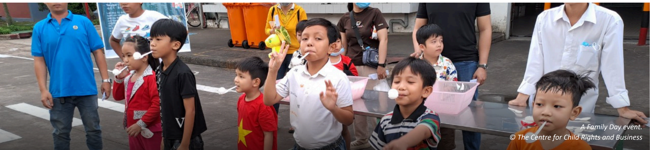
A Family Day event.