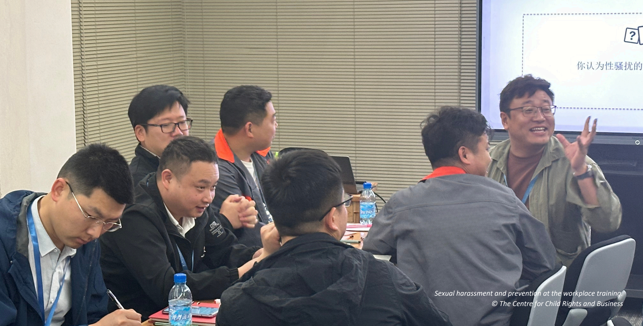
Sexual harassment and prevention at the workplace training.