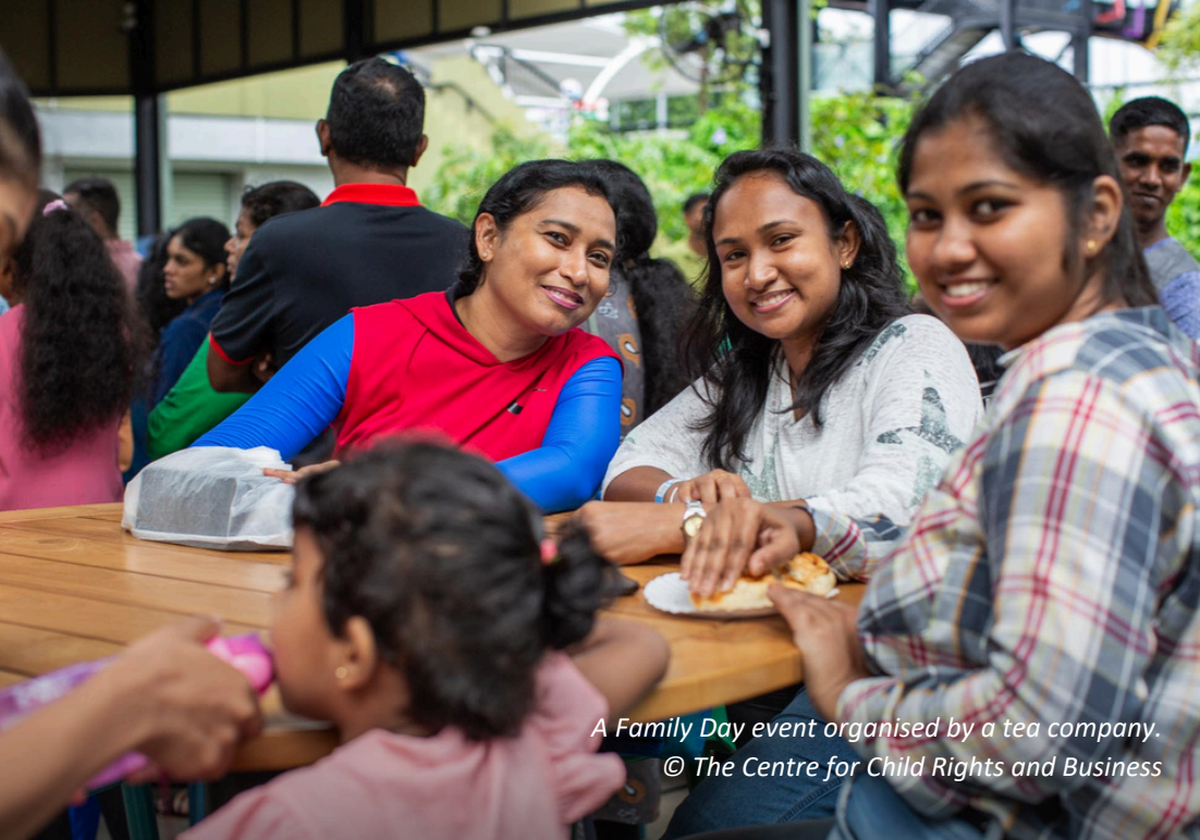
A Family Day event organised by a tea company.