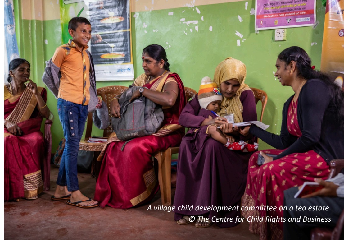
A village child development committee on a tea estate.