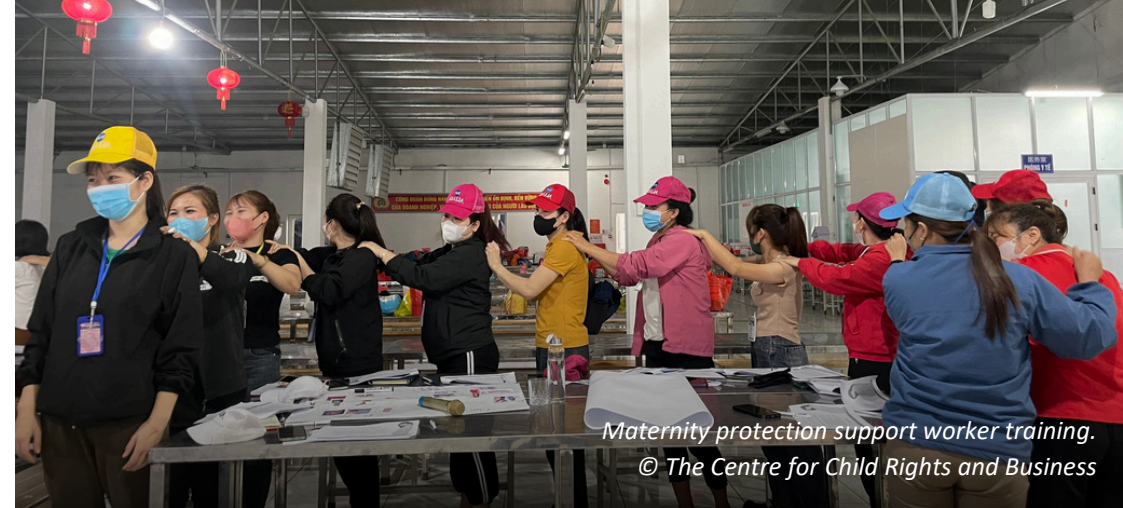
Maternity protection support worker training.