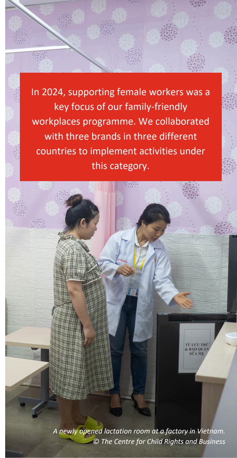
A newly opened lactation room at a factory in Vietnam.

In 2024, supporting female workers was a key focus of our family-friendly workplaces programme. We collaborated with three brands in three different countries to implement activities under this category.