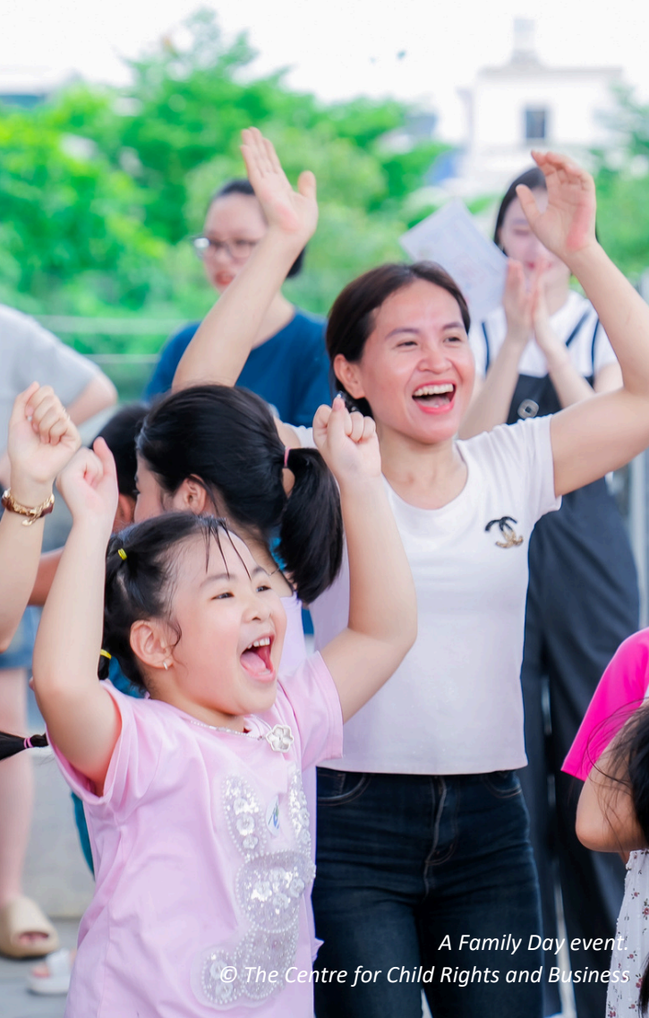
A Family Day event.