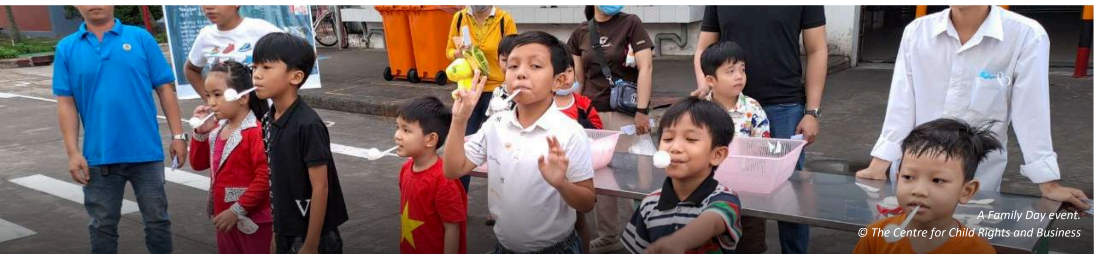
A Family Day event.