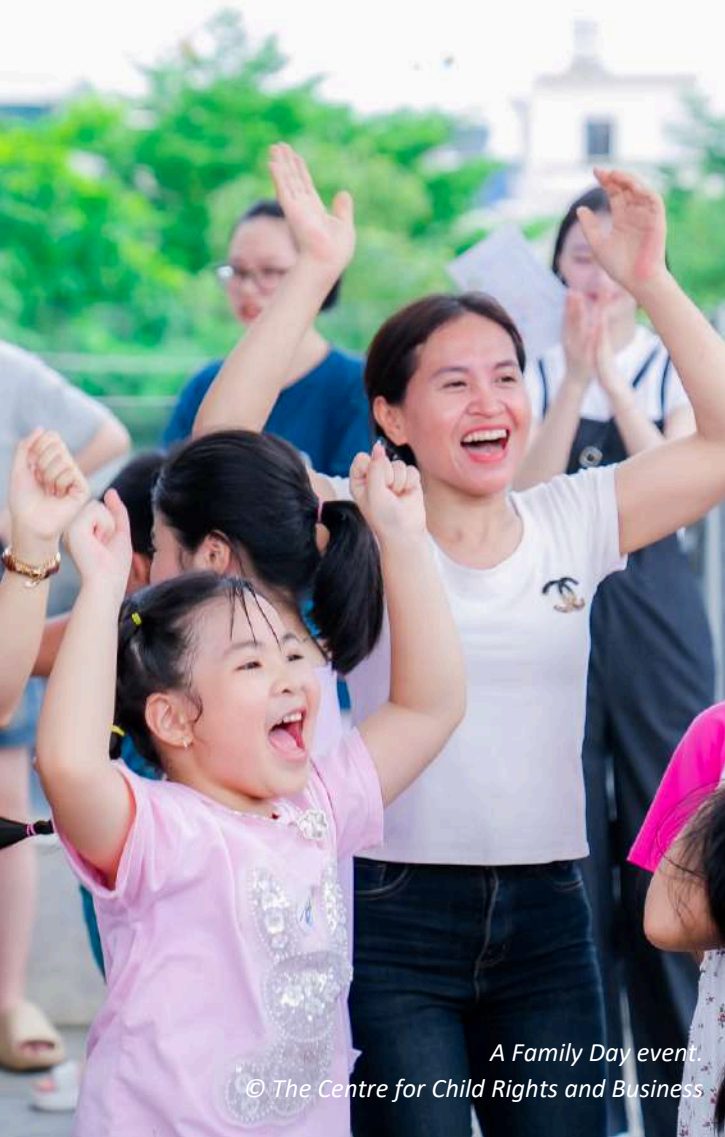
A Family Day event.