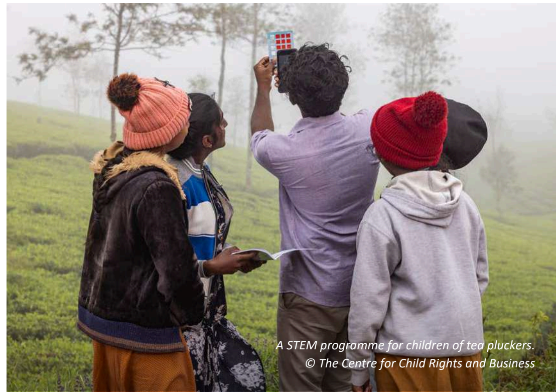
A STEM programme for children of tea pluckers.