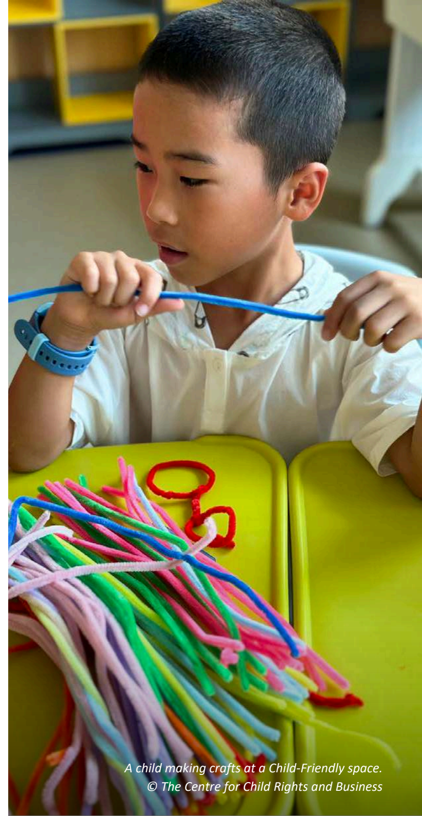
A child making crafts at a Child-Friendly space.

were trained to continue running the Child-Friendly Spaces independently while following The Centre's guidelines