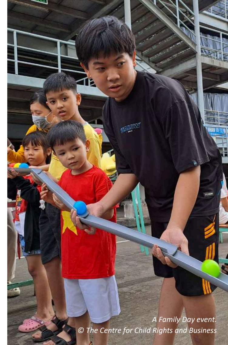
A Family Day event.

Investing in family-friendly workplace programmes brings tangible, direct benefits to workers, their families and employers. Employers can reap the long-term benefits of a more stable, motivated and efficient workforce by creating enabling, supportive environments for parents.