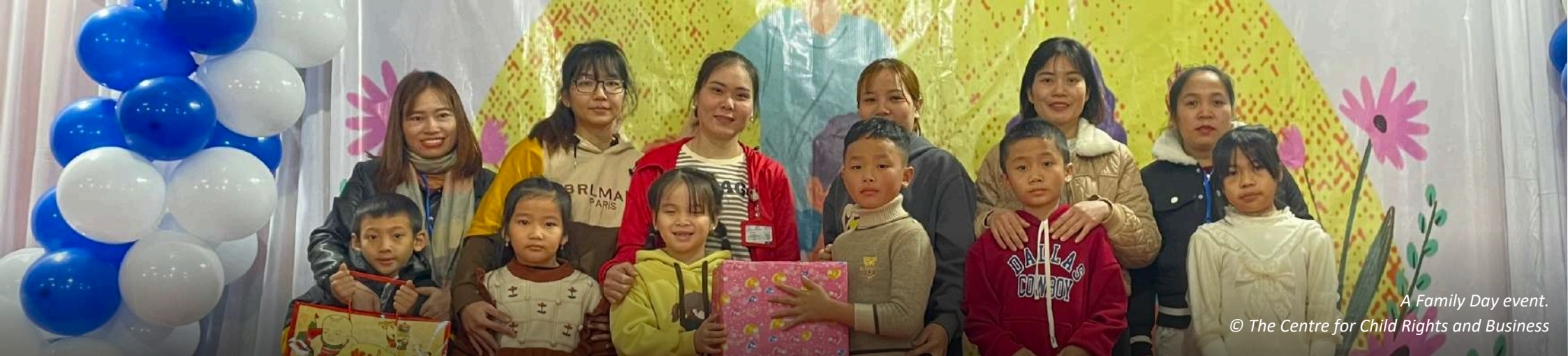
A Family Day event.