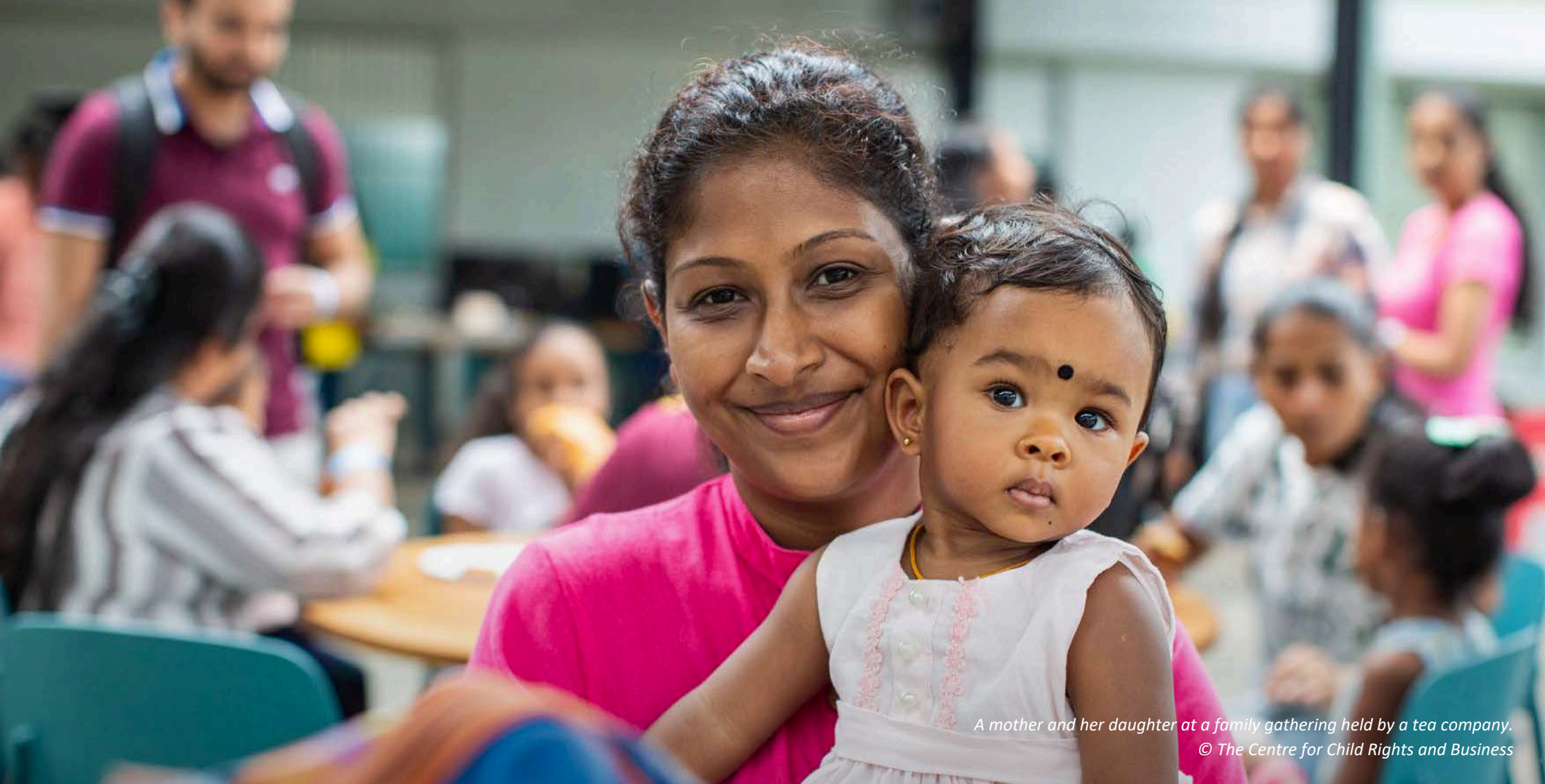
A mother and her daughter at a family gathering held by a tea company.