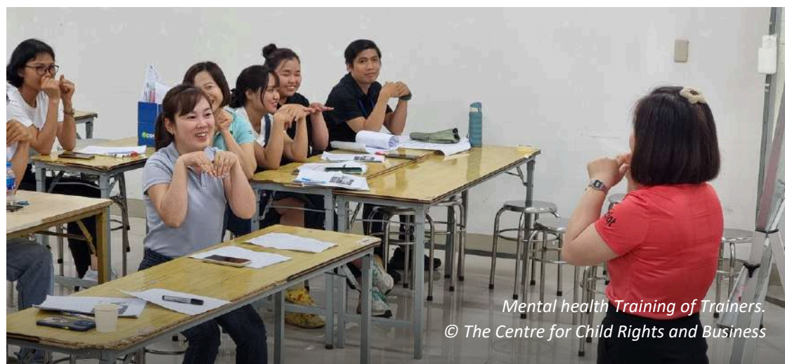
Mental health Training of Trainers.