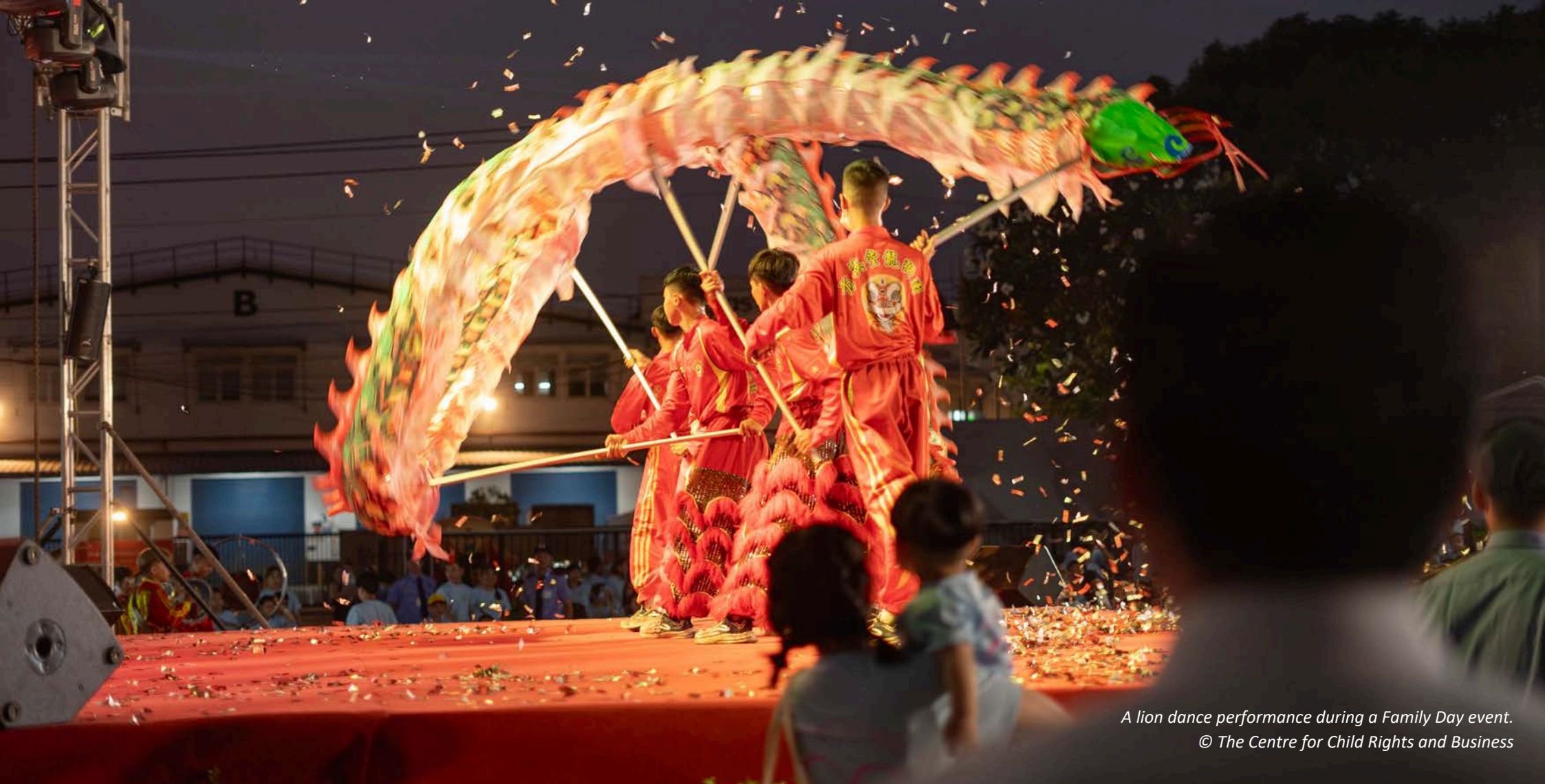
A lion dance performance during a Family Day event.