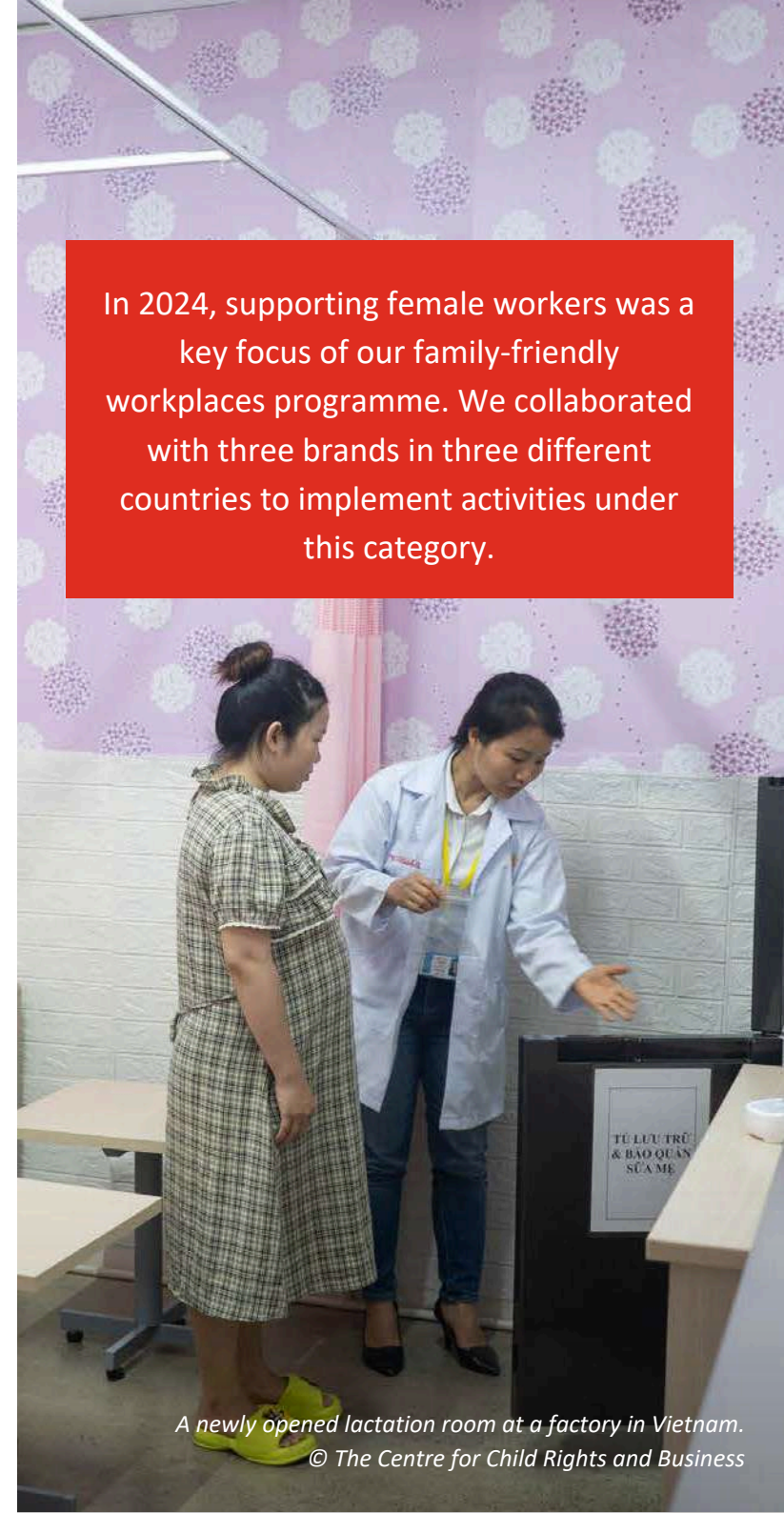
A newly opened lactation room at a factory in Vietnam.

In 2024, supporting female workers was a key focus of our family-friendly workplaces programme. We collaborated with three brands in three different countries to implement activities under this category.