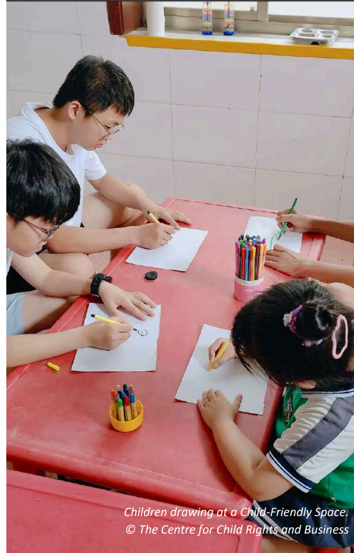
Children drawing at a Child-Friendly Space.