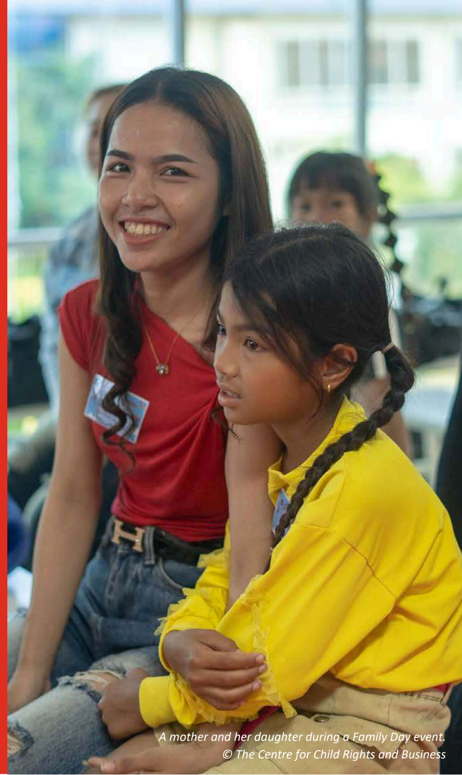
A mother and her daughter during a Family Day event.

Our services cater to the needs of working parents, their children, and young workers, aligning with the business objectives of suppliers. WeCare is dedicated to empowering both workers and factory management teams through knowledge and skills training, building or enhancing supportive workplace facilities, and capacity building and tool sharing.