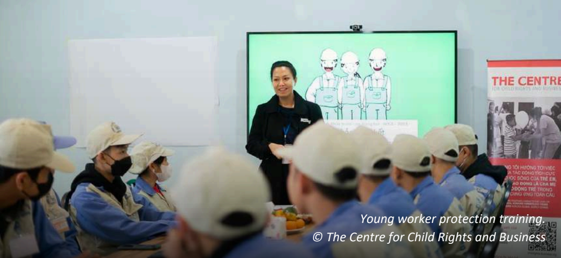
Young worker protection training.