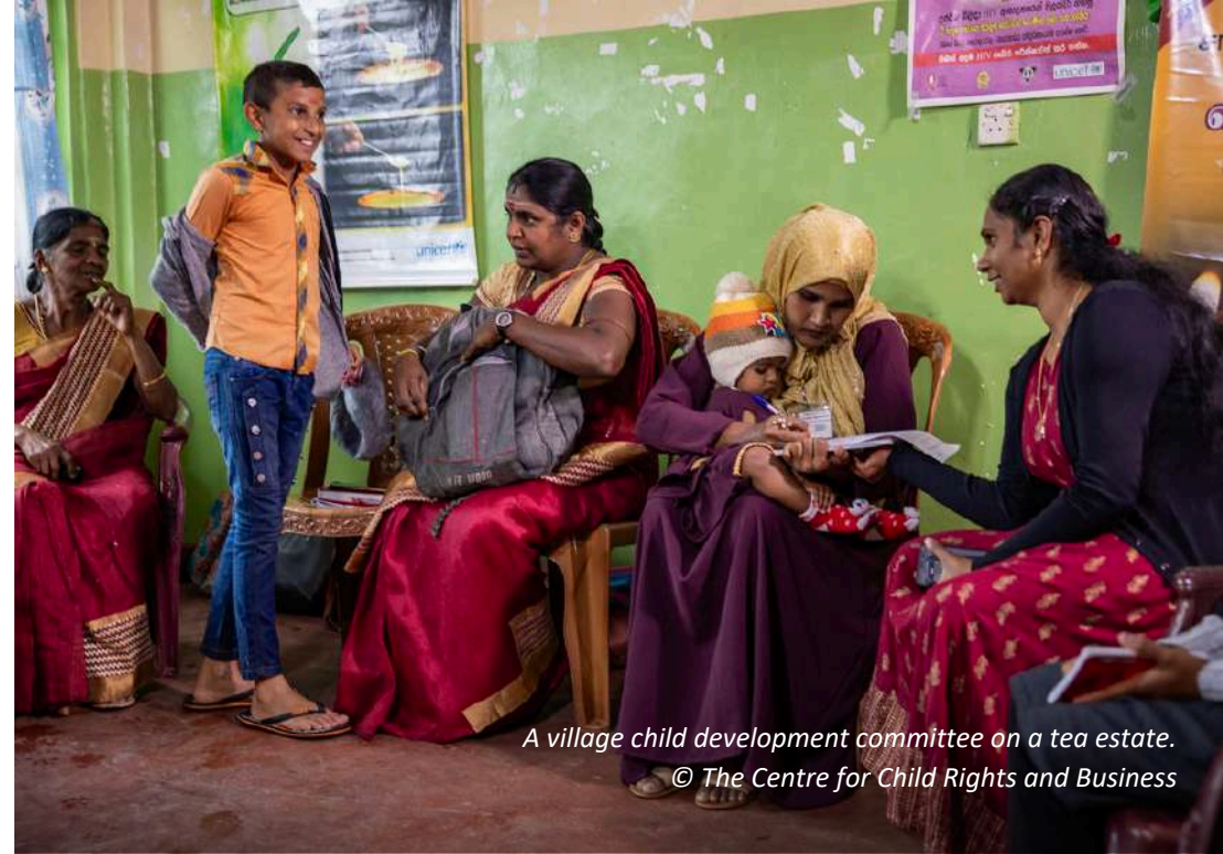
A village child development committee on a tea estate.