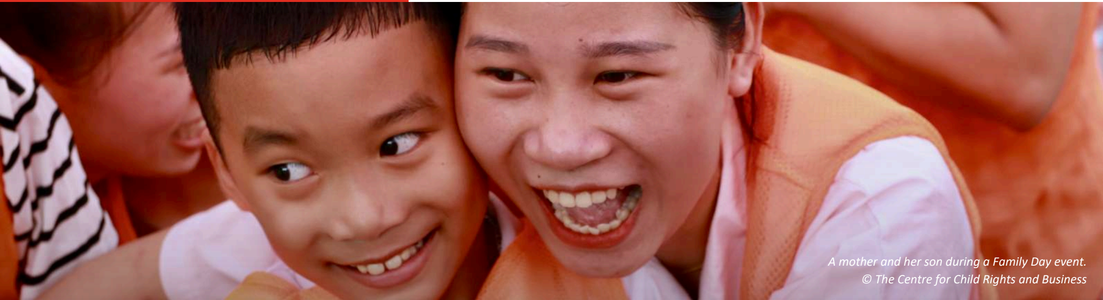
A mother and her son during a Family Day event.