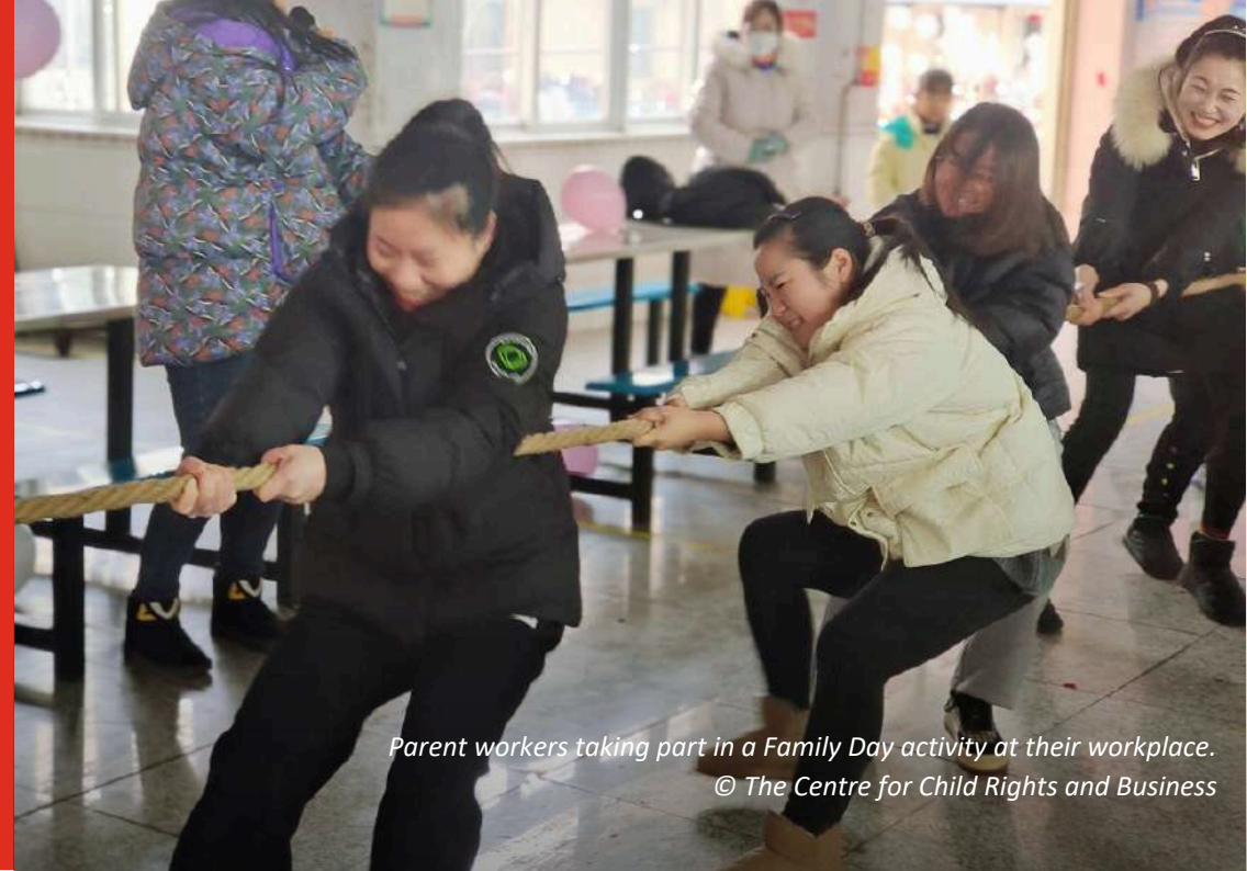
Parent workers taking part in a Family Day activity at their workplace.

Bangladesh, Cambodia, China, Indonesia, Philippines, Sri Lanka, Türkiye, and Vietnam.