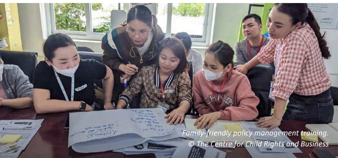
Family-friendly policy management training.