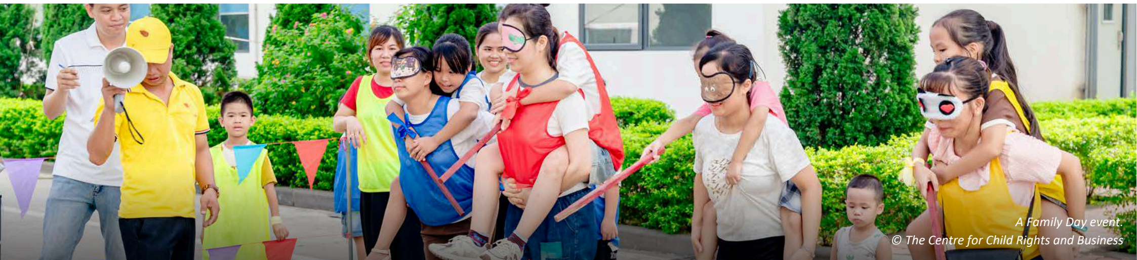
A Family Day event.