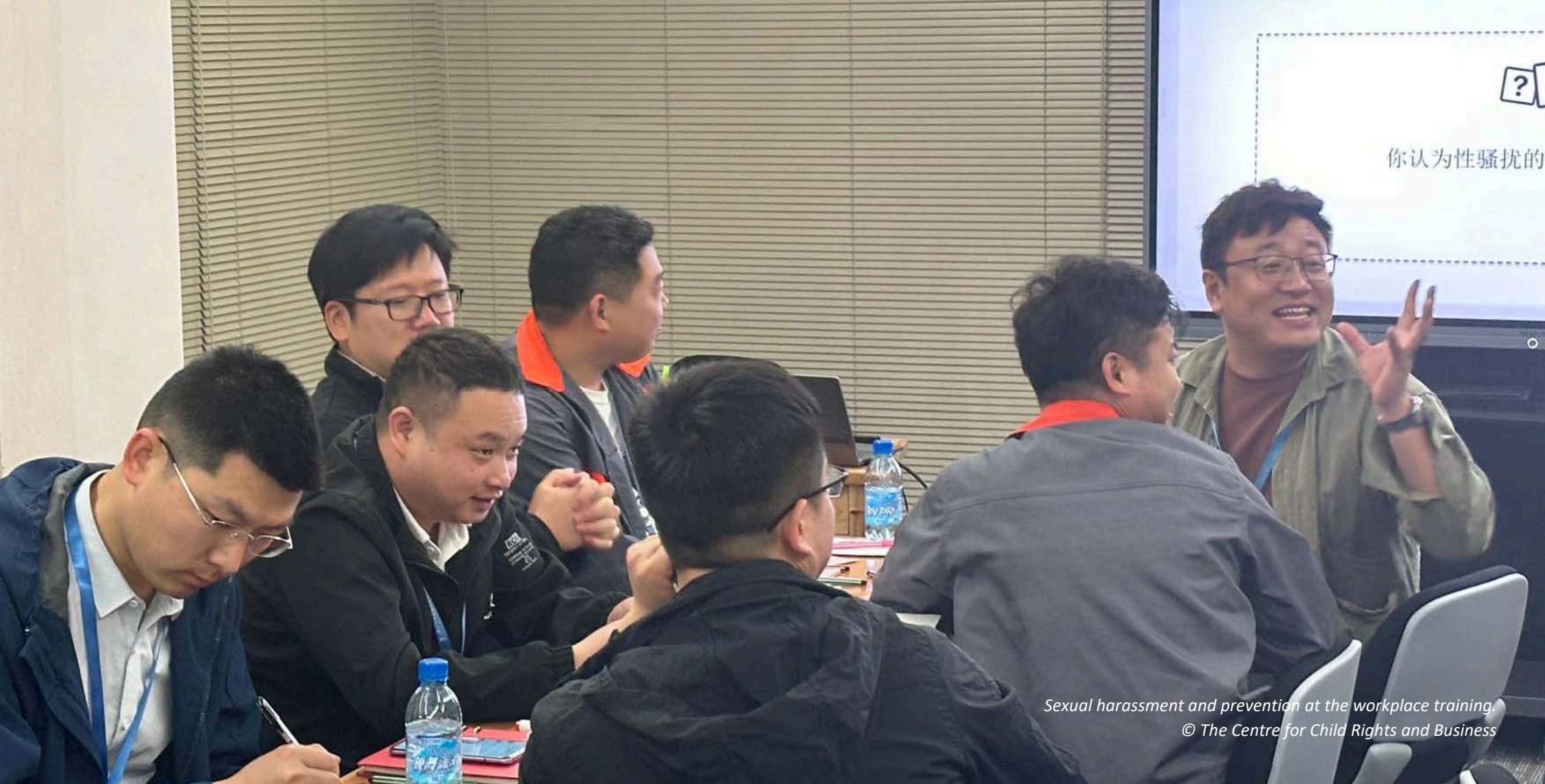
Sexual harassment and prevention at the workplace training.