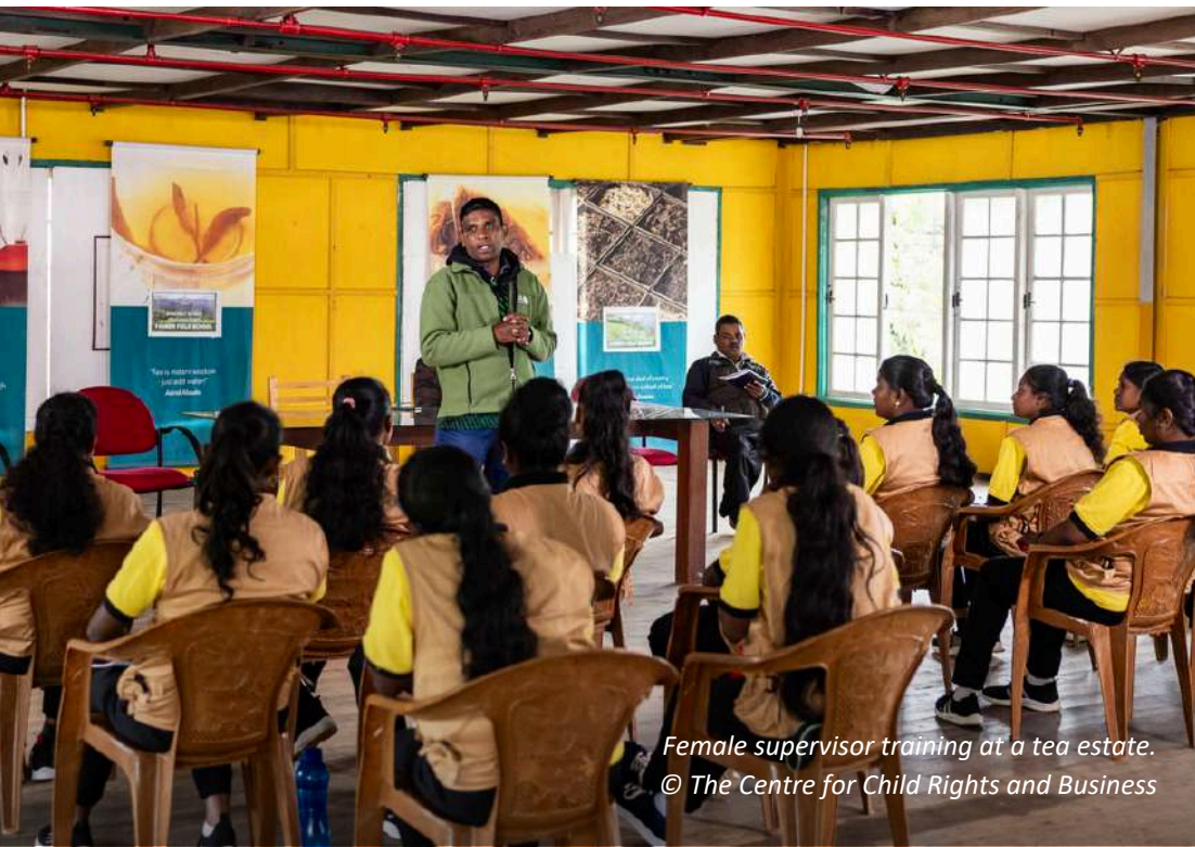
Female supervisor training at a tea estate.