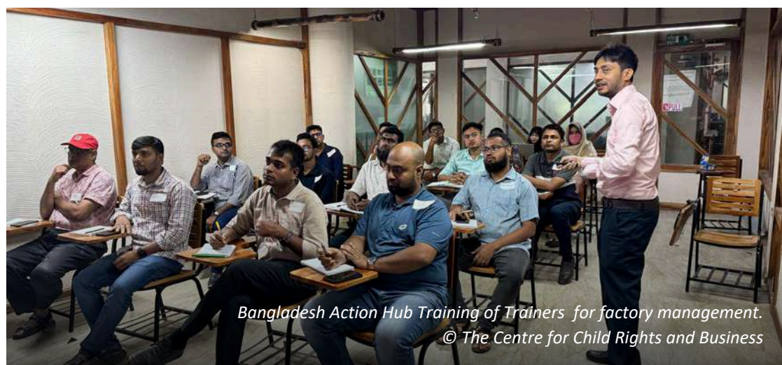
Bangladesh Action Hub Training of Trainers for factory management.