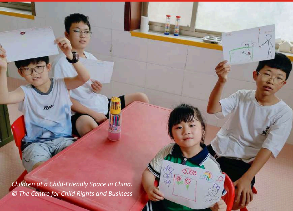
Children at a Child-Friendly Space in China.

To date, we have supported 27 companies in setting up 104 Child-Friendly Spaces globally