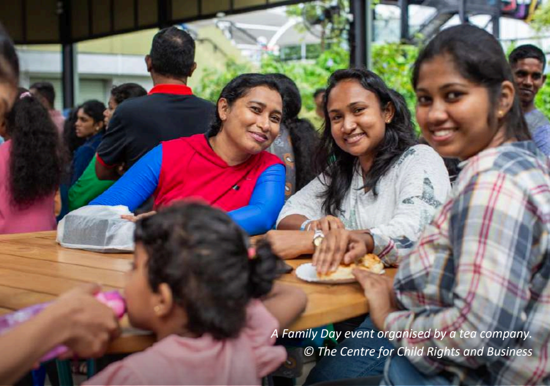
A Family Day event organised by a tea company.