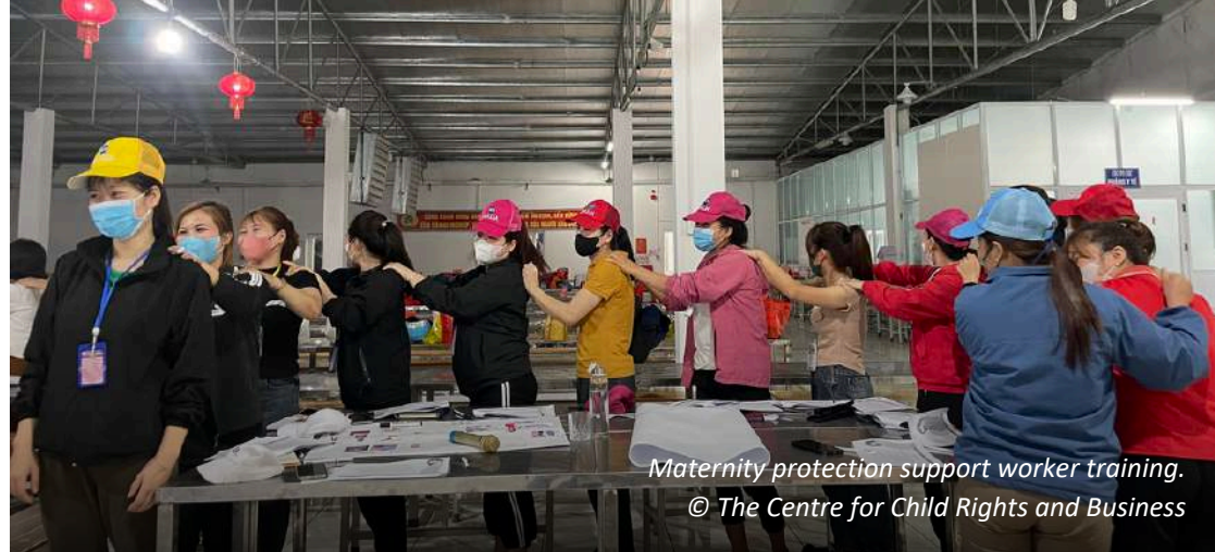
Maternity protection support worker training.