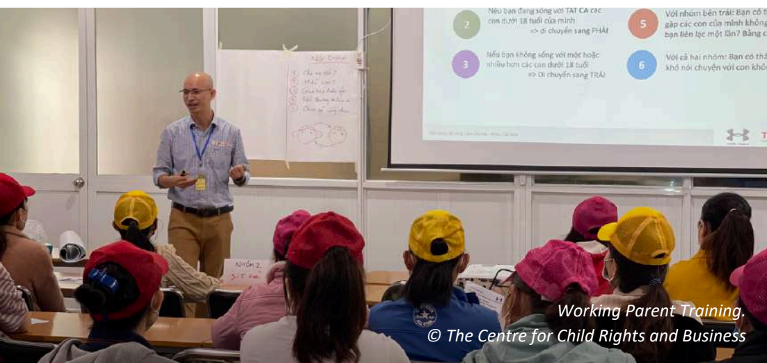
Working Parent Training.