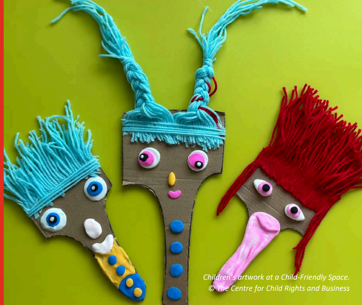
Children's artwork at a Child-Friendly Space.

We provide a programme menu with credits, allowing factories to customise the programme activities based on their specific needs.